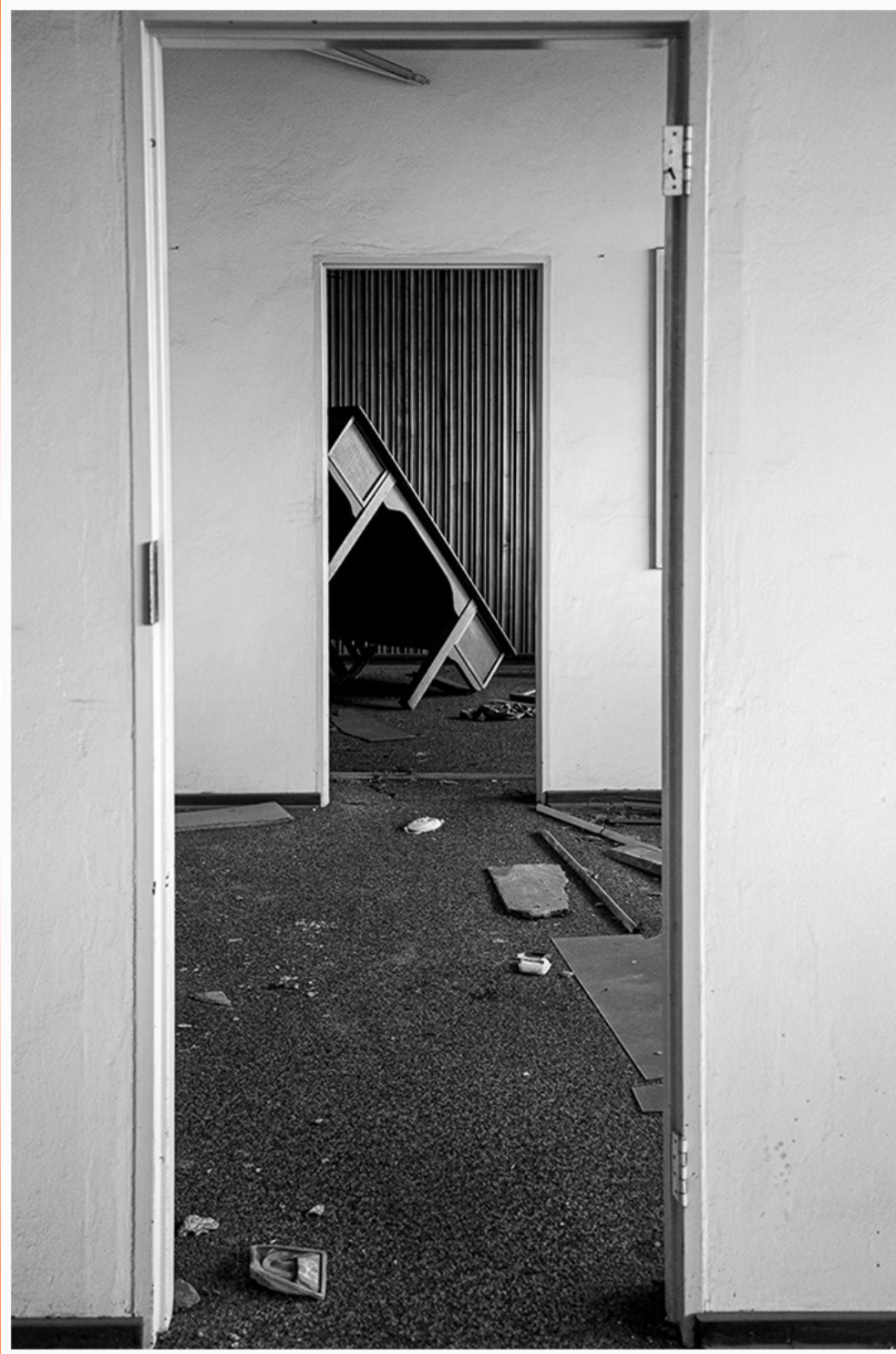
Wenner van Februarie se kamerafoto - Junior Tema - Verlate - Solitary